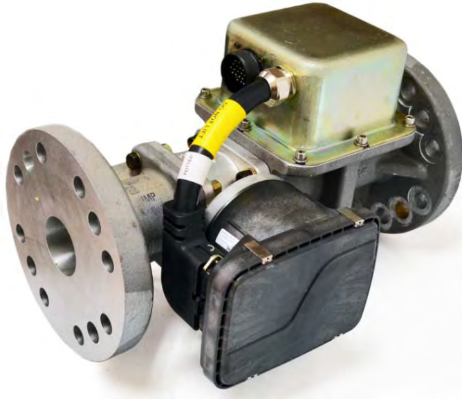
TecJet 52 (2 nd Gen)