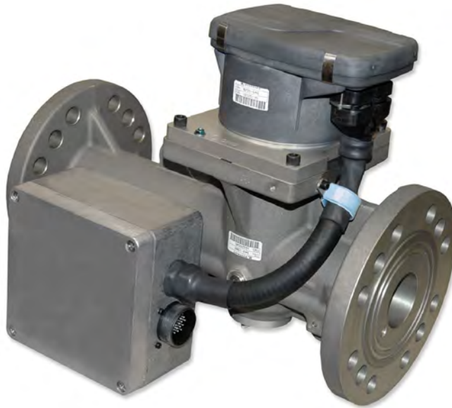
TecJet 52 (1 st Gen)