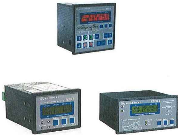
MFR3, MFR1, ESDR4 GW4