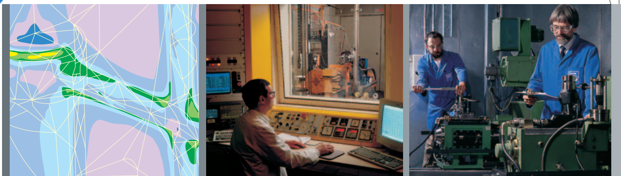
Main: Internal 3D stress analysis. This page, left to right: Stress analysis, data acquisition, development test facilities.

A dedicated engineering team ensures world class design using the most advanced techniques ranging from cam design to finite modelling and stress and impact analysis. Substantial investment in extensive test facilities guarantees the highest standards of performance, reliability and durability.